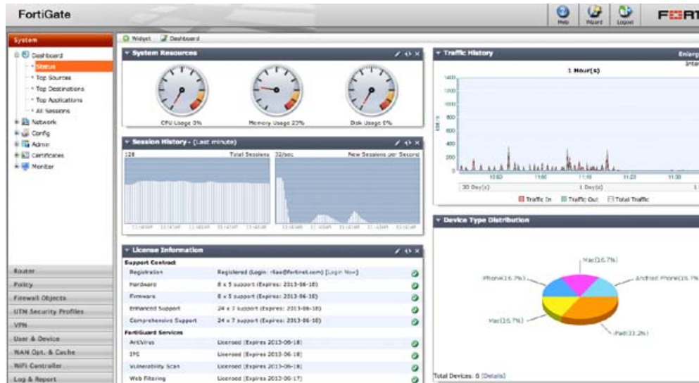
FortiOS Dashboard — Single Pane of Glass Management

Fortinet FortiCare support offerings provide comprehensive global support for all Fortinet products and services. You can rest assured your Fortinet security products are performing optimally and protecting your users, applications, and data around the clock.